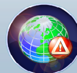
Maps & Traffic