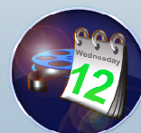
Movies & Events